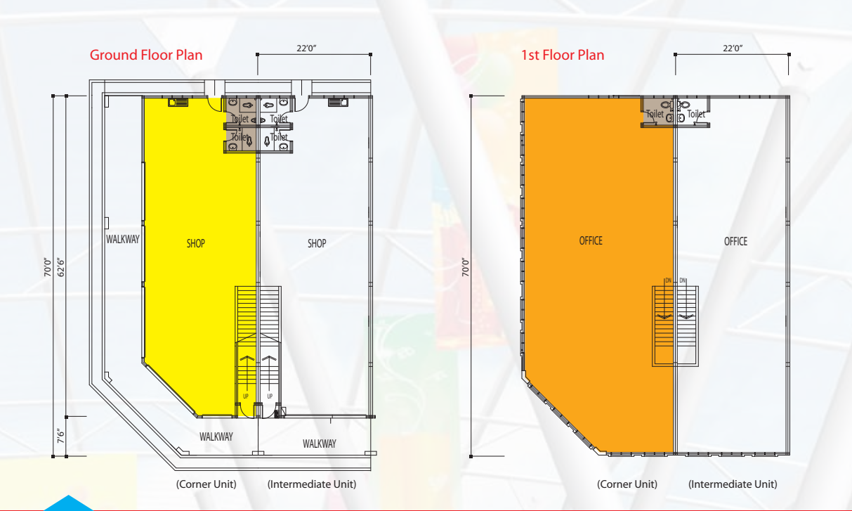
Type A Built-up Area: 2,915 sq. ft.