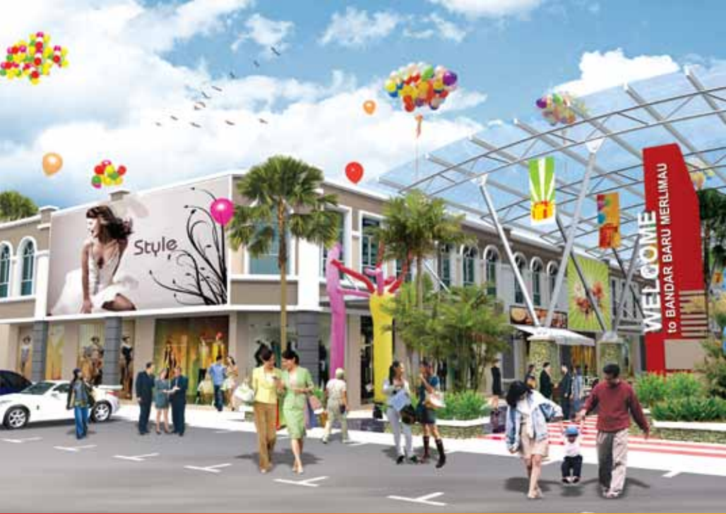
Double-Storey Shop Office 双层店铺办公楼 (22' x 80')