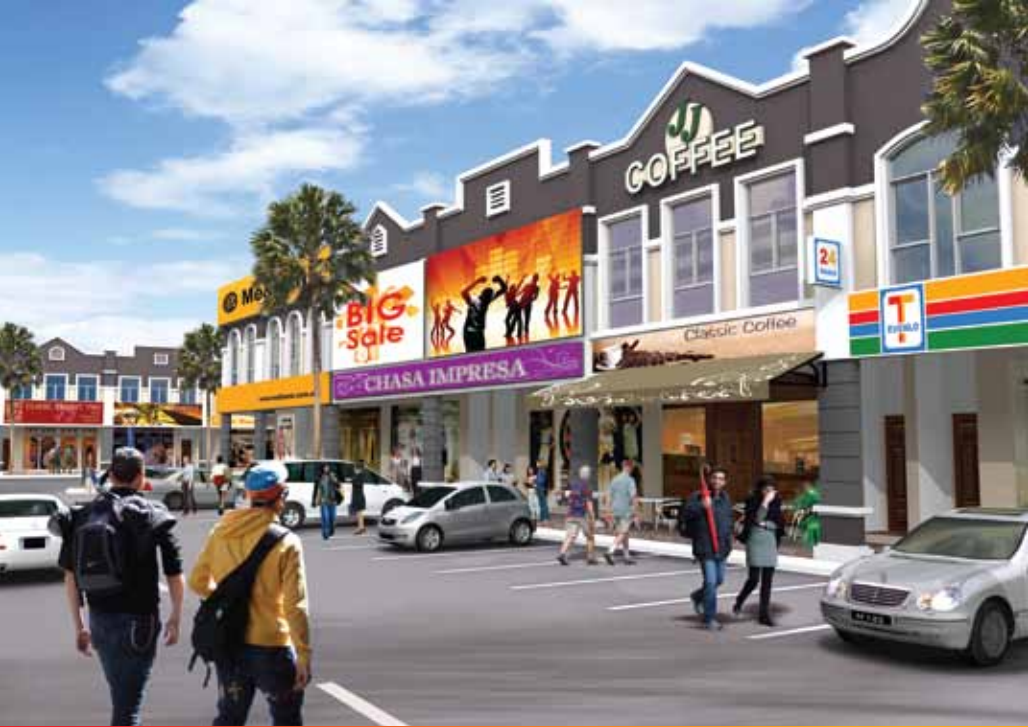
Double-Storey Shop Office 双层店铺办公楼 (22' x 70')