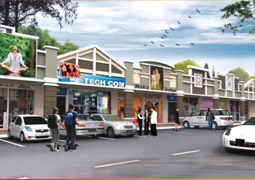
SINGLE-Storey Shop 单层店铺 (22' x 70')